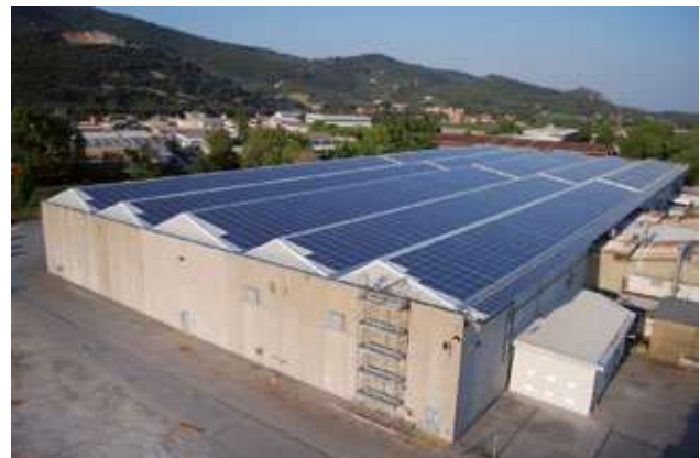
Fleck production site in Pisa, Italy

All Autotrol, Fleck and SIATA products have been certified by major EU certificates. On top of that, our Pisa plant is ISO 9001:2015 certified.